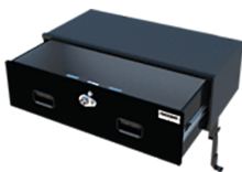
Cargo Area Safe

TN LEADS THE NATION FOR GUNS STOLEN FROM CARS WITH 5,000+ STOLEN EVERY YEAR